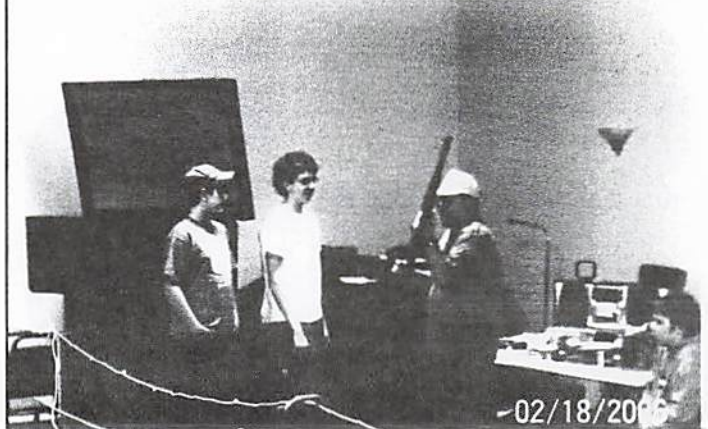
Pictured above are participants in the Hunter Safety Class